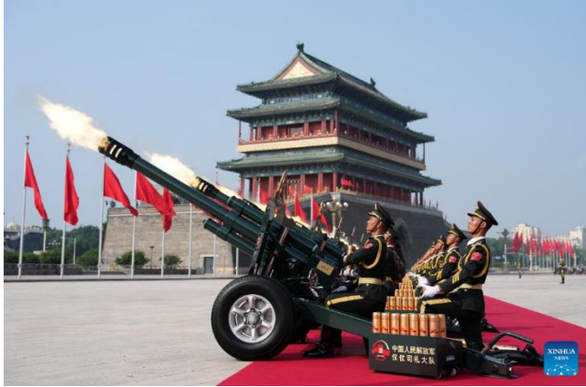
Soldiers fire gun salute during a grand gathering to commemorate the 80th anniversary of the victory in the Chinese People's War of Resistance against Japanese Aggression and the World Anti-Fascist War in Beijing, capital of China, Sept. 3, 2025.