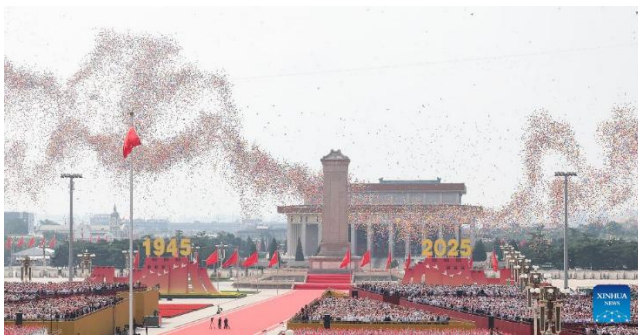
Balloons and pigeons are released into the sky over Tian'anmen Square in Beijing, capital of China, Sept. 3, 2025. China on Wednesday held a grand gathering to commemorate the 80th anniversary of the victory in the Chinese People's War of Resistance against Japanese Aggression and the World Anti-Fascist War.