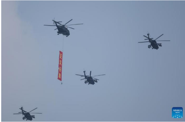
The flag-guarding air echelon takes part in a grand gathering to commemorate the 80th anniversary of the victory in the Chinese People's War of Resistance against Japanese Aggression and the World Anti-Fascist War in Beijing, capital of China, Sept. 3, 2025.