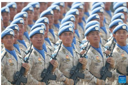
Chinese UN peacekeepers march through Tian'anmen Square during a military parade in Beijing, capital of China, Sept. 3, 2025. China on Wednesday held a grand gathering to commemorate the 80th anniversary of the victory in the Chinese People's War of Resistance against Japanese Aggression and the World Anti-Fascist War.