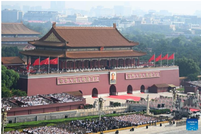
A grand gathering to commemorate the 80th anniversary of the victory in the Chinese People's War of Resistance against Japanese Aggression and the World Anti-Fascist War is held in Beijing, capital of China, Sept. 3, 2025.