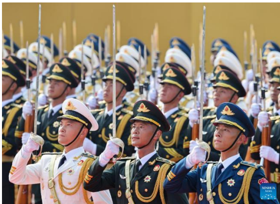
Honor guards stand in formation during a grand gathering to mark the 80th anniversary of the victory in the Chinese People's War of Resistance against Japanese Aggression and the World Anti-Fascist War in Beijing, capital of China, Sept. 3, 2025.