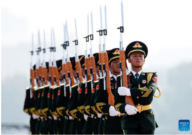
Parade guards step in place during a grand gathering to mark the 80th anniversary of the victory in the Chinese People's War of Resistance against Japanese Aggression and the World Anti-Fascist War, which includes a military parade, in Beijing, capital of China, Sept. 3, 2025.