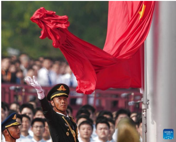
A national flag-raising ceremony is held at Tian'anmen Square during a grand gathering to mark the 80th anniversary of the victory in the Chinese People's War of Resistance against Japanese Aggression and the World Anti-Fascist War in Beijing, capital of China, Sept. 3, 2025.