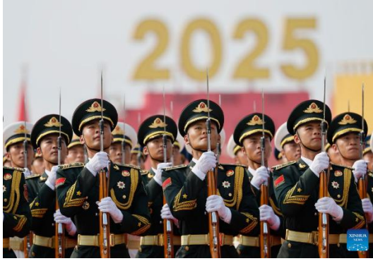
Honor guards stand in formation during a grand gathering to mark the 80th anniversary of the victory in the Chinese People's War of Resistance against Japanese Aggression and the World Anti-Fascist War in Beijing, capital of China, Sept. 3, 2025.