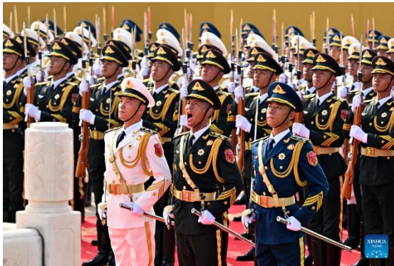
Honor guards stand in formation during a grand gathering to mark the 80th anniversary of the victory in the Chinese People's War of Resistance against Japanese Aggression and the World Anti-Fascist War in Beijing, capital of China, Sept. 3, 2025.