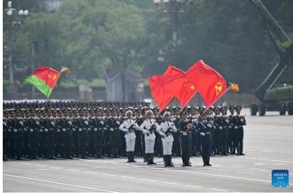
The People's Liberation Army (PLA) Guards of Honor formation attends a parade during a grand gathering to mark the 80th anniversary of the victory in the Chinese People's War of Resistance against Japanese Aggression and the World Anti-Fascist War in Beijing, capital of China, Sept. 3, 2025.